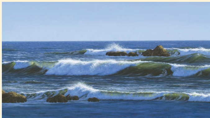
"Seaside Serenade" $9,700 24" x 48"