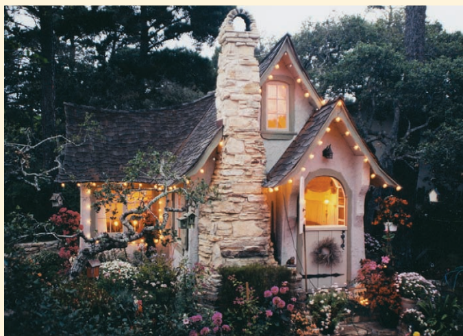
"Hansel House Illuminated" $900 24" x 30"